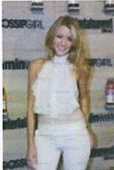
Blake Lively seductively styled at 'Gossip Girl' premiere

Victoria's Secret (2006) : Blend of Sexy and Tartan Victoria's Secret (2005) Victoria's Secret (2003)