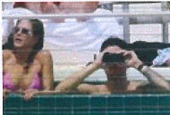
John Mayer on why he dumped Jennifer Aniston