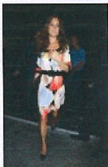
Kate Middleton's colorful night out with Prince William