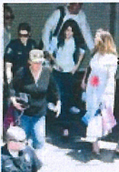
Selena Gomez effortlessly chic at UR Votes Count event