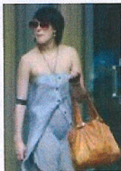
Rumer Willis: My dad and Ashton get along-it's not weird

Celebrate Your Curves This Summer & Get 10% Off Your First Order Today! www.simplyyours.co.uk