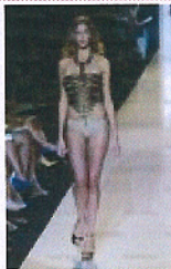
Ed Hardy Swimwear by Christian Audigier: Runway photos