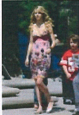
The adorable Taylor Swift on set with Jonas Brothers

Organisers say delegations from China, India and Japan will be attending amid plans to put their cuisine in the spotlight during future festivals.