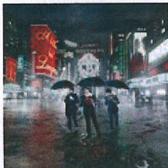
Jonas Brothers' 'A Little Bit Longer' headed for the top slot